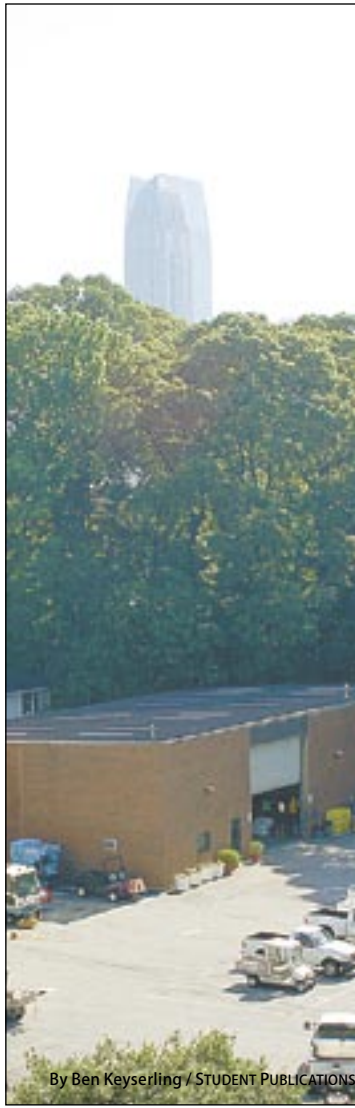
By Ben Keyserling / STUDENT PUBLICATIONS

Being the Facilities Landscape Manager isn't an easy job, however. There are many common misconceptions. Most people within the Tech community do not realize that Ide's team fixes and maintains all of their own equipment. So not only do they maintain Tech's campus environment, but they also have the knowledge and skill to fix the tools and equipment that they work with on a daily basis.