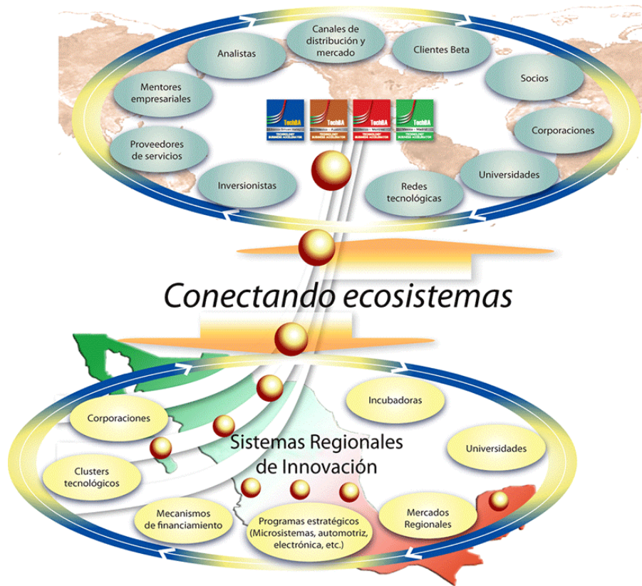
Figure 2 - "Connecting Ecosystems"