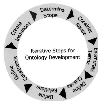
FIGURE 1. Ontology development (Noy and McGuinness 2001): The process of developing and deploying biological ontologies is a community effort that requires frequent iteration of the basic steps represented here as a cycle. The process begins by determining the scope of the ontology and proceeds next to considering how the ontology will be used. This is followed by enumeration of terms and definition of classes and relations, and the constraints that operate on these. Finally, the classes are populated with instances to create knowledge bases.