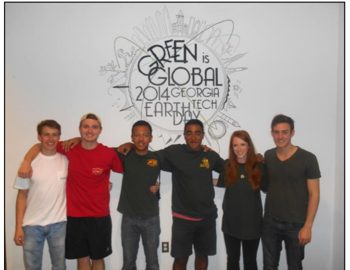
The finished mural, depicting the winning design from the 2014 Georgia Tech Earth Day design contest.