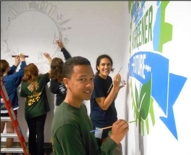
Tech Beautification Day 2014 mural painting project at the Klaus building's 3 rd floor recycling alcove.

On Saturday, March 29, hundreds of students took part in Tech Beautification Day, an annual volunteer event at Georgia Tech. Student volunteers spent the morning helping out with various landscaping and cleanup projects on campus. This year, three of the projects benefitted the recycling program. Students helped to clean up the community recycling center on east campus, paint a mural at one of the recycling alcoves in the Klaus building, and build a replica of the Campanile out of aluminum cans. Thank you to the student volunteers, Tech Beautification Day coordinators, and Georgia Tech Landscape Services for all of your hard work!