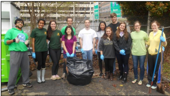
Tech Beautification Day volunteers cleaned up the east campus main recycling center.