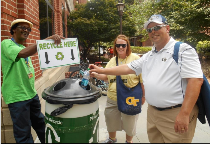
Home Game #1: August 31 (vs. Wofford) Attendance: 45,403 Kickoff Time: 12:30 PM Amount Recycled: 3.14 tons

The Game Day Recycling program's 7 th season is off to a great start! We are averaging 4.1 tons of recyclable materials collected per game, for an overall recycling rate of 26% on game days. There are still two more home games remaining this season, so this could very well be our best season yet! Since the program began in 2008, 128.8 tons of material have been diverted from the landfill.