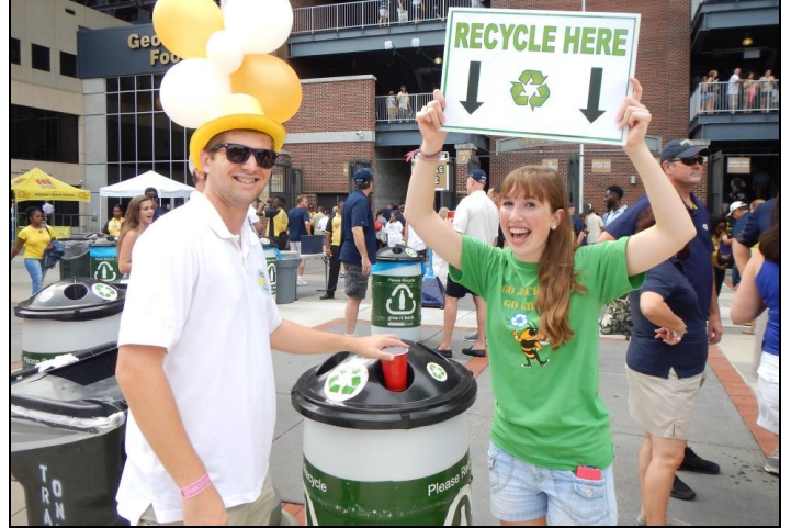
Home Game #2: September 13 (vs. Ga Southern) Attendance: 53,173 Kickoff Time: 12:00 PM Amount Recycled: 4.76 tons