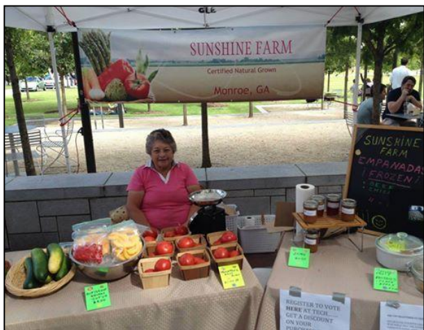
Sunshine Farms, one of the produce vendors at Georgia Tech's weekly Farmers Market.

Many exciting changes are taking place at dining locations across campus. In the Student Center Food Court, plastic clamshells have been replaced with compostable options. Simply To Go products, such as fresh fruit and yogurt, are served in compostable greenware. To-go cutlery in the Food Court is now compostable, and is no longer individually wrapped in plastic. Campus dining locations, including Woodruff Dining Hall, Dunkin Donuts, Chick-Fil-A, and Starbucks, serve sustainably farmed, Fair Trade certified coffee. Dunkin Donuts has switched from polystyrene foam to paper cups for small, medium, and large hot beverages. Chick-fil-A has also switched to paper coffee cups, and is on the wait list for paper cups for cold beverages. Soon, the only polystyrene foam cups remaining at campus dining locations will be XL cups at Dunkin Donuts and milkshake cups at Chick-fil-A. The reason they will remain is that the companies don't yet offer an alternative product.