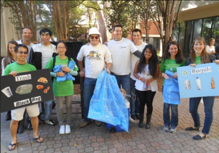
Home Game #3: October 4 (vs. Miami) Attendance: 52,221 Kickoff Time: 7:30 PM Amount Recycled: 5.30 tons