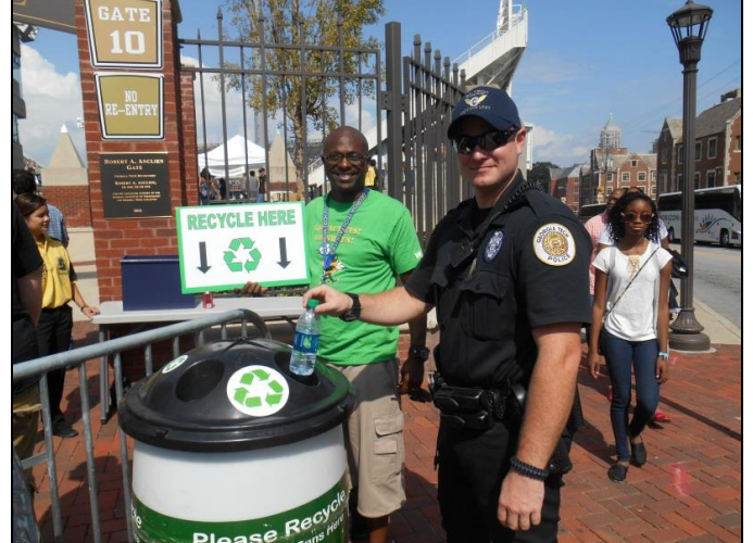
Home Game #4: October 11 (vs. Duke) Attendance: 44,281 Kickoff Time: 12:30 PM Amount Recycled: 3.18 tons