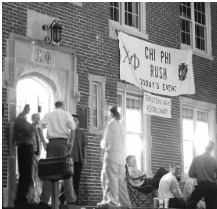
By Charles Frey / STUDENT PUBLICATIONS

Although Chi Phi was suspended from campus due to IFC and administration sanctions last spring, the fraternity continues to operate as a fraternity with the support of local alumni and the national organization.